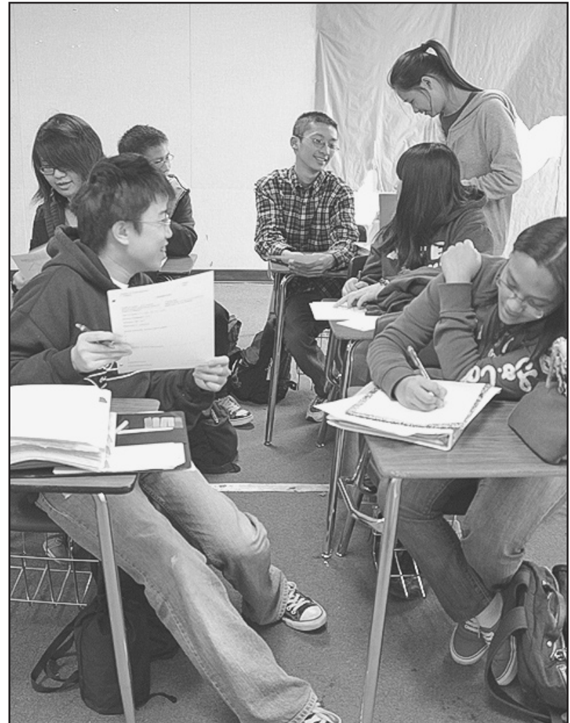
STAND AND DELIVER AFE members consult with their fellow tutors about plans for their next tutoring session.

AFE tutors also help with Crossroads, an afterschool tutoring program. It meets every Tuesday and Thursday from 3 to 4 p.m. in D-101 or D-103, to aid those who need assistance in a variety of subjects, including Mathematics, World History, Biology, Physics and English.