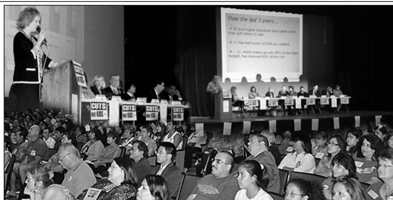
'STOP CUTS TO EDUCATION' Over the past two years, AUSD has cut over $50 million. With $6-15 million more in cuts expected that will continue to reduce jobs and will result in program reductions, such as fewer AP and elective options, as well as reduced music and arts and sports programs, parents, students, faculty and staff gather at a Town Hall Meeting on May 3 at San Gabriel High School's auditorium to "invest in our children and our community."