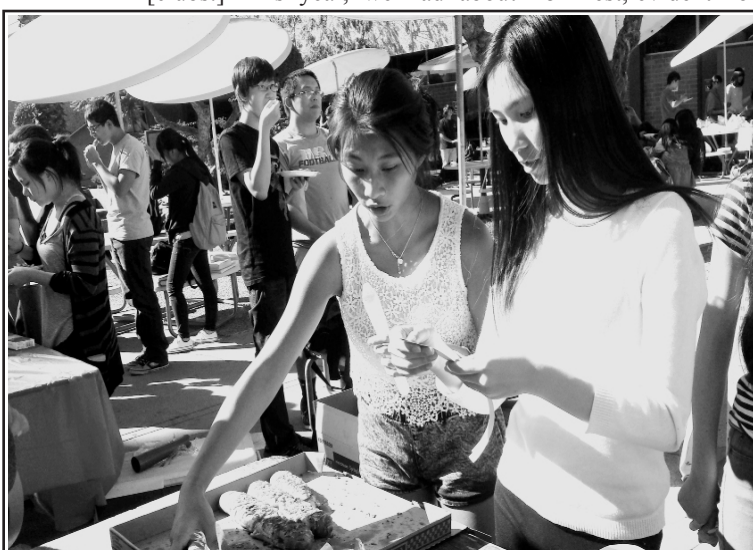
FOOD FAIR RETURNS In the first Food Fair of the year, AHS students gathered at the Quad to sell food in order to fundraise for their respective clubs.

Many students expressed their interest, evident from the long lines at most of the booths available.