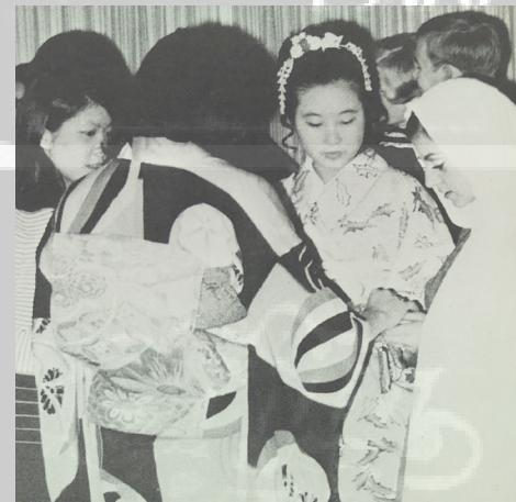
Members of the 1970 International Club display their native costumes.