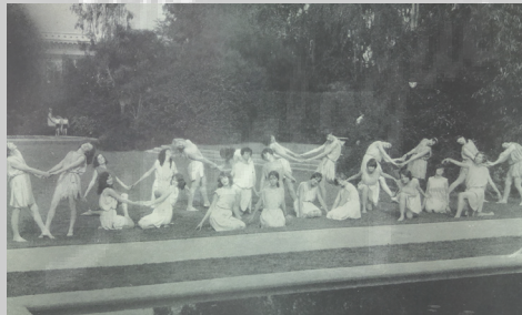
In 1932, AHS had a Natural Dancing team that had over fifty members. The girls danced barefoot and wore simple costumes of Greek design, all of which were in pastel colors.