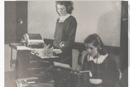
The Commercial Department was founded in 1907. They taught classes such as typing, shorthand, business, bookkeeping and salesmanship. The department grew along with the business field.